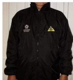
Reversible Match Fleece (waterproof) £22.00

All available for collection or delivered (P&P extra).