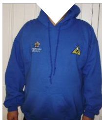
YHUA Hoodie £20