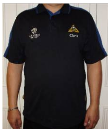
After Match Shirt (personalized) £18.50